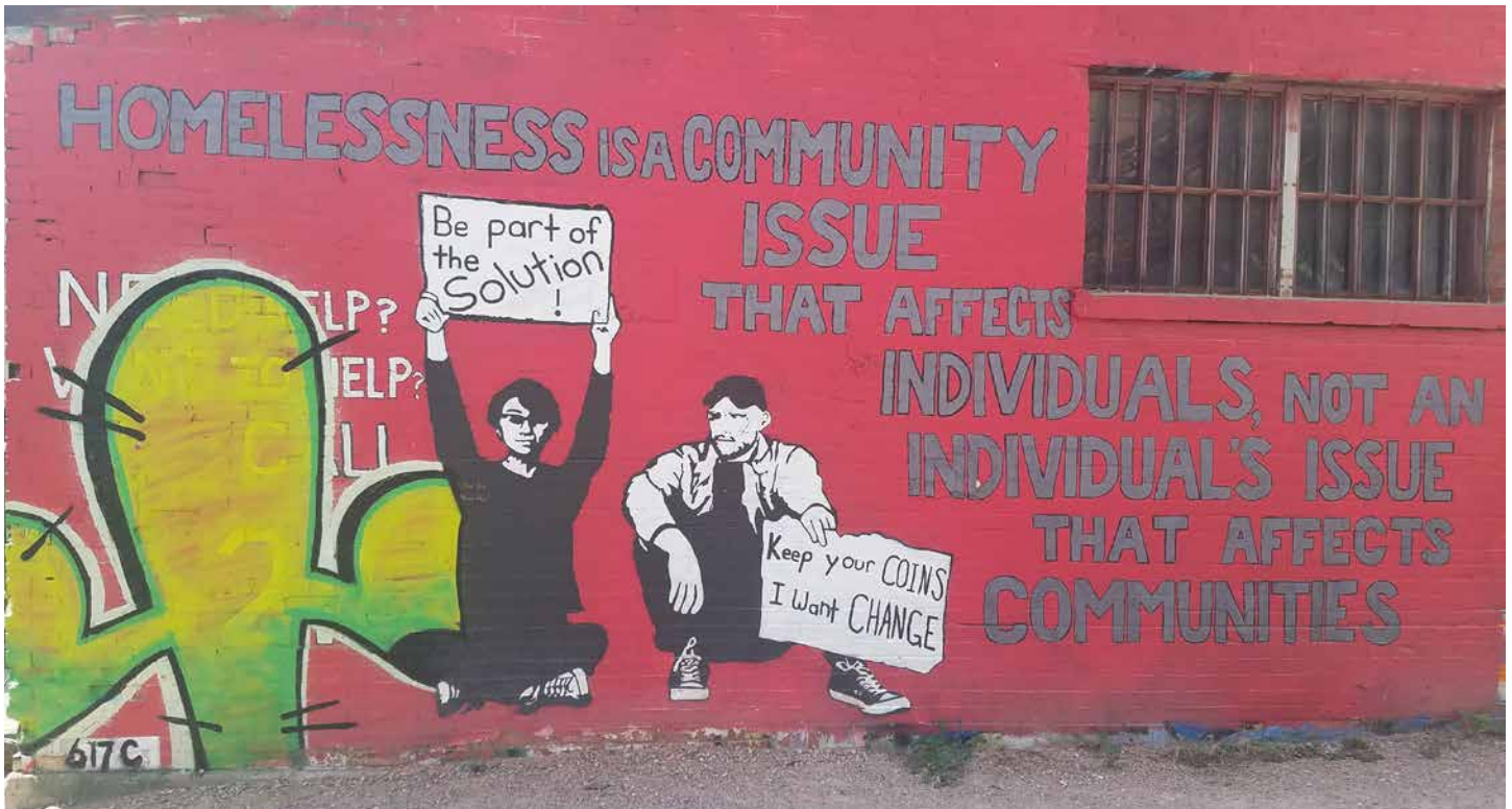
The photos in this document are from Pennington County, South Dakota, one of the 52 Safety and Justice Challenge sites, and the host of the IACP and APA roundtable.