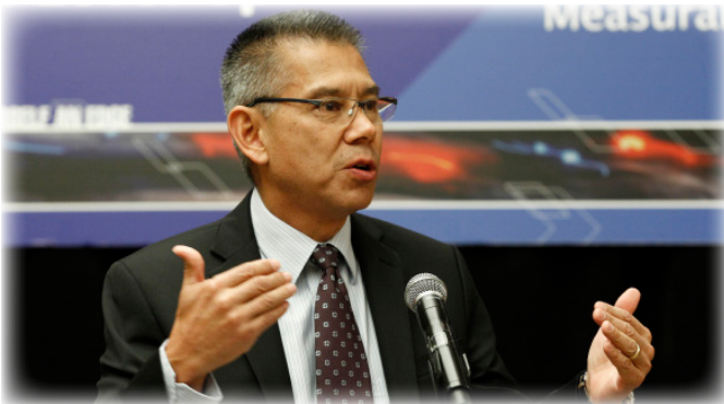
CHP Commissioner Joseph Farrow speaks at the IACP Highway Safety Awards Breakfast in Chicago, Illinois, where CHP was awarded the Special Award for Bike/Pedestrian Safety.