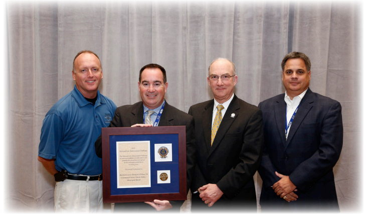
Henrico County Police Division received the Commercial Motor Vehicle Safety - Municipal/Sheriff Special Award at the IACP Highway Safety Awards Breakfast in Chicago, Illinois.

Truck drivers coming from any direction now pass three to four signs clearly directing them to the correct and approved route to the area's industrial park.