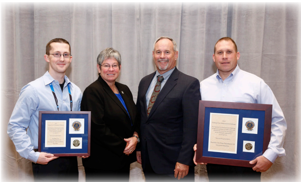
The Peachtree City Police Department was presented the Occupant Protection Special Award and the First Place Municipal 26-75 Sworn Officers Award at the IACP Highway Safety Breakfast in Chicago, Illinois.

PCPD assigned seven officers to its traffic-focused Community Response Team in 2014. Each officer was tasked with organizing routine seat belt details involving at least two officers and a spotter, usually a motorcycle officer, in high-collision-frequency corridors of the city during peak collision times. In