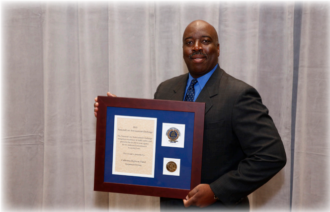
CHP was awarded the Impaired Driving Special Award at the IACP Highway Safety Awards Breakfast in Chicago, Illinois.

Beyond its grant-funded activities, CHP also administered DUI education through numerous other programs. Through its Start Smart program,