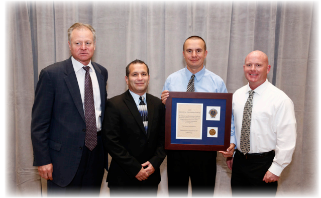
The Parker Police Department was presented the Technology Special Award at the IACP Highway Safety Breakfast in Chicago, Illinois.

“It's about officer safety, it's about efficiency, and it's about community safety, all of which we can improve by better utilizing our resources.”