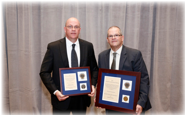
The Roanoke County Police Department was presented the Speed Awareness Special Award at the IACP Highway Safety Breakfast in Chicago, Illinois.

Public information and education was key to its speed awareness success, according to RCPD, which leveraged speed trailers and social media to inform citizens about speed-related crashes and enforcement.