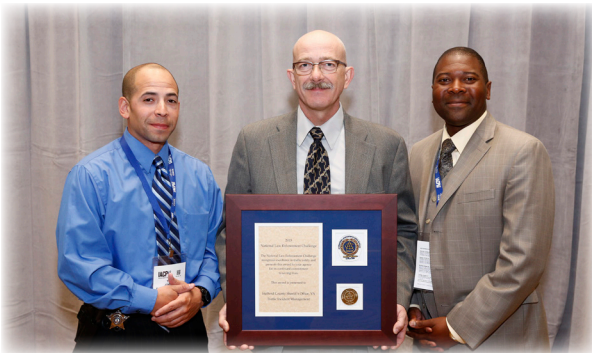
The Stafford County Sheriff’s Office was awarded the Traffic Incident Management Special Award at the IACP Highway Safety Breakfast in Chicago, Illinois.

The Stafford County Sheriff’s Office built upon SHRP 2 with its own protocols and tools. It began initiating lane designation, using level notifications and scene size-ups when arriving on the scene of incidents, for example; establishing a paging system to page traffic units to keep in their patrol car as a quick reference for items such as lane designation, common terminology, fatal auto crash checklists, vehicle bomb standoff charts, and HAZMAT notes.